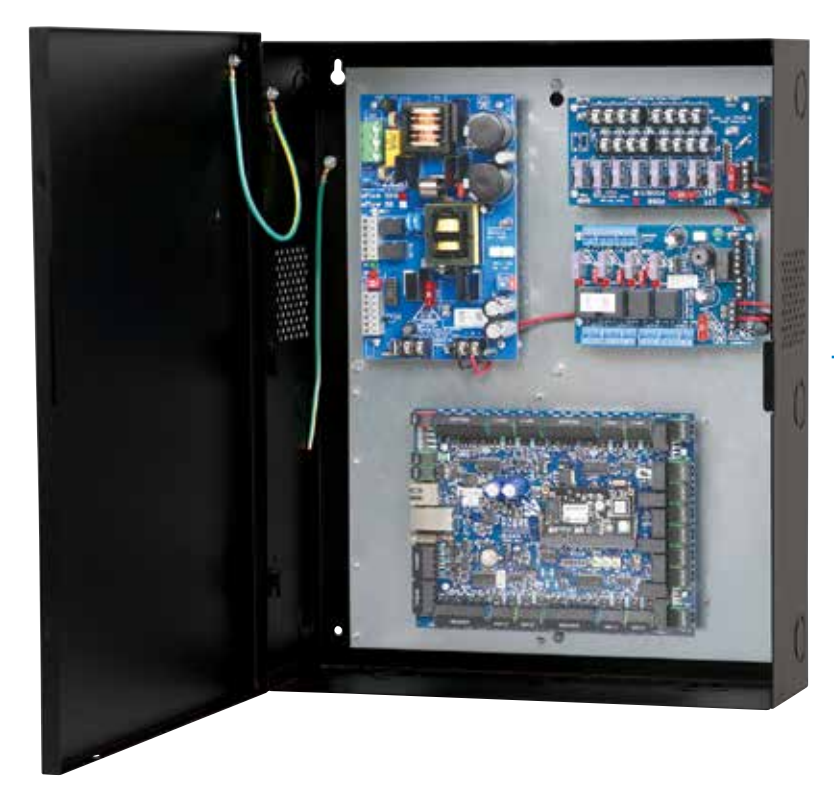
T1AAK3F4S 8-Door Access System with Power